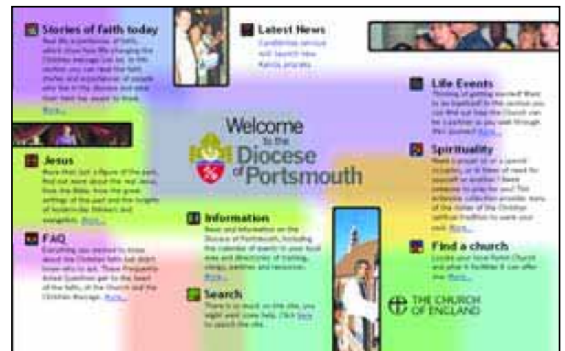
The re-designed home page of the new website