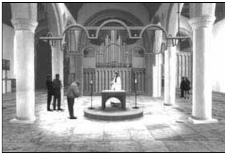
The proposed new layout for Christ Church, Portsdown

A separate chapel will also be created at the opposite end of the church, where the sanctuary is now. A new extension will