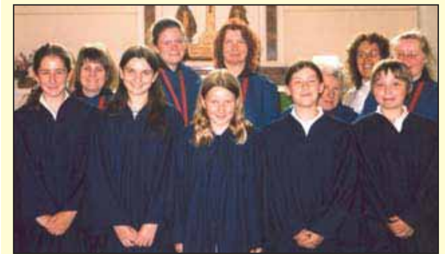
The choir from St Mark's and St Edmund's, Wootton, with the existing choir members at the back and the new recruits in front

"What may not often be appreciated is that this is a significant mission post and very effective at supporting the Church's ministry among children and young people."