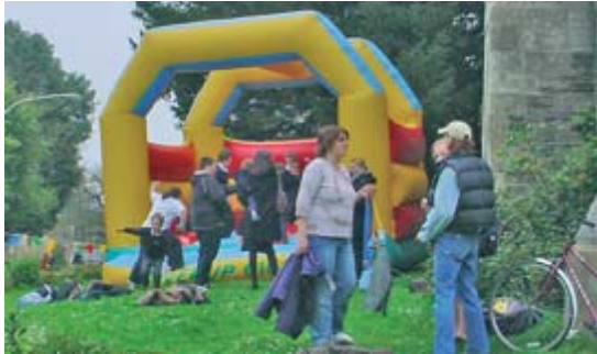
Families enjoy the bouncy castle outside St John's on the open day held by the church and The Park Centre

IT'S a church that is now firmly at the heart of its local community.