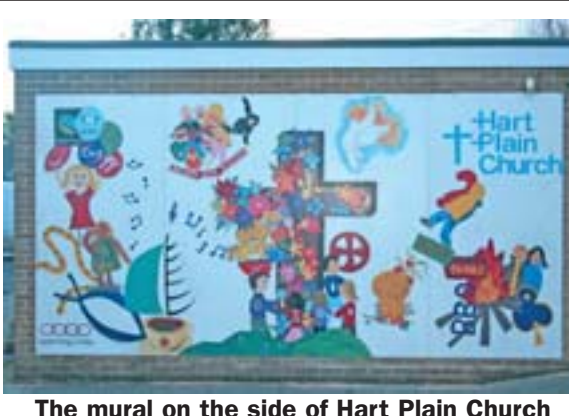
The mural on the side of Hart Plain Church

One of the most moving projects they visited was a refuge for ex-prisoners in the countryside. It's a halfway house that helps former inmates to find homes, get jobs and break away from addictions. Another